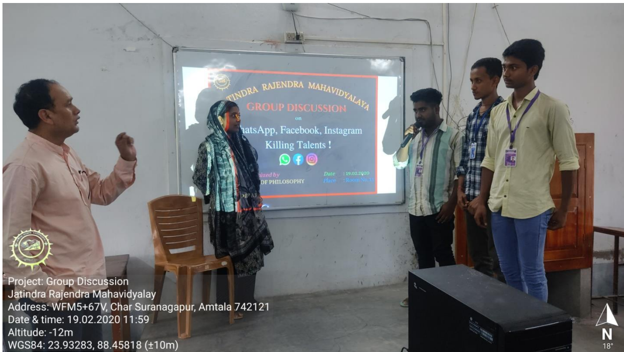
Project: Group Discussion Jatindra Rajendra Mahavidyalay Address: WFM5+67V, Char Suranagapur, Amtala 742121 Date & time: 19.02.2020 11:59 Altitude: -12m WGS84: 23.93283, 88.45818 (±10m)