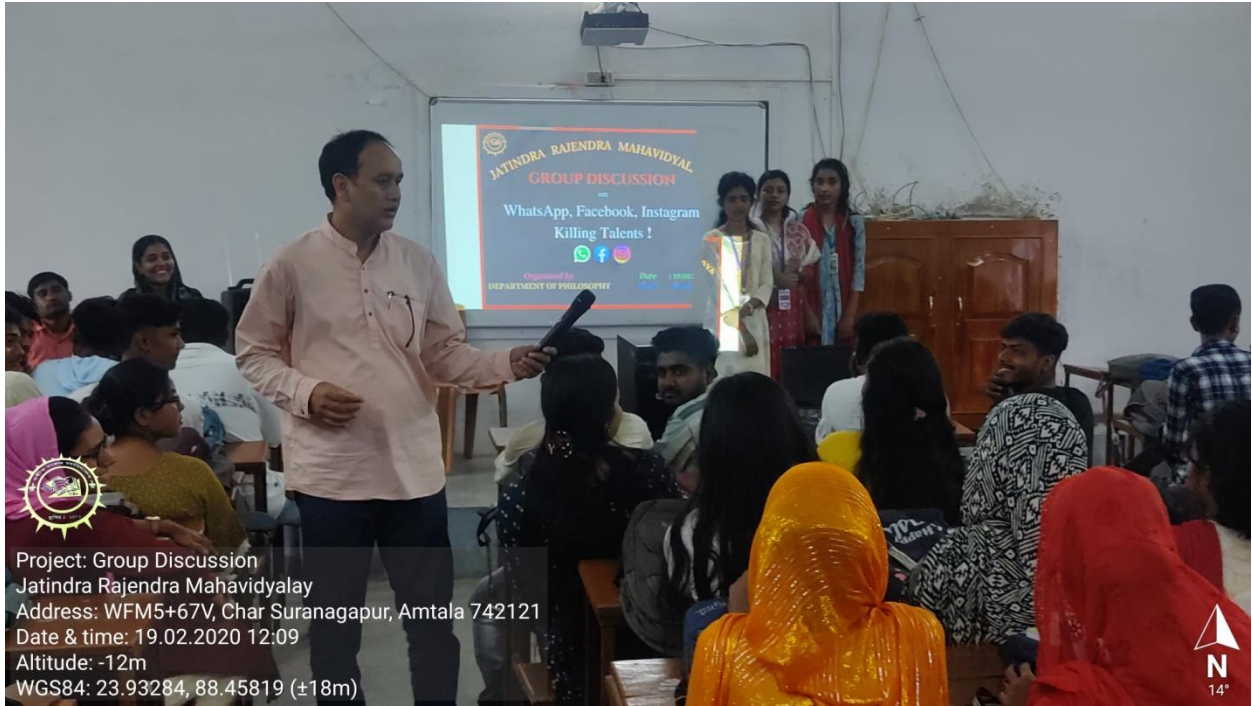
Project: Group Discussion Jatindra Rajendra Mahavidyalay Address: WFM5+67V, Char Suranagapur, Amtala 742121 Date & time: 19.02.2020 12:09 Altitude: -12m WGS84: 23.93284, 88.45819 (±18m)