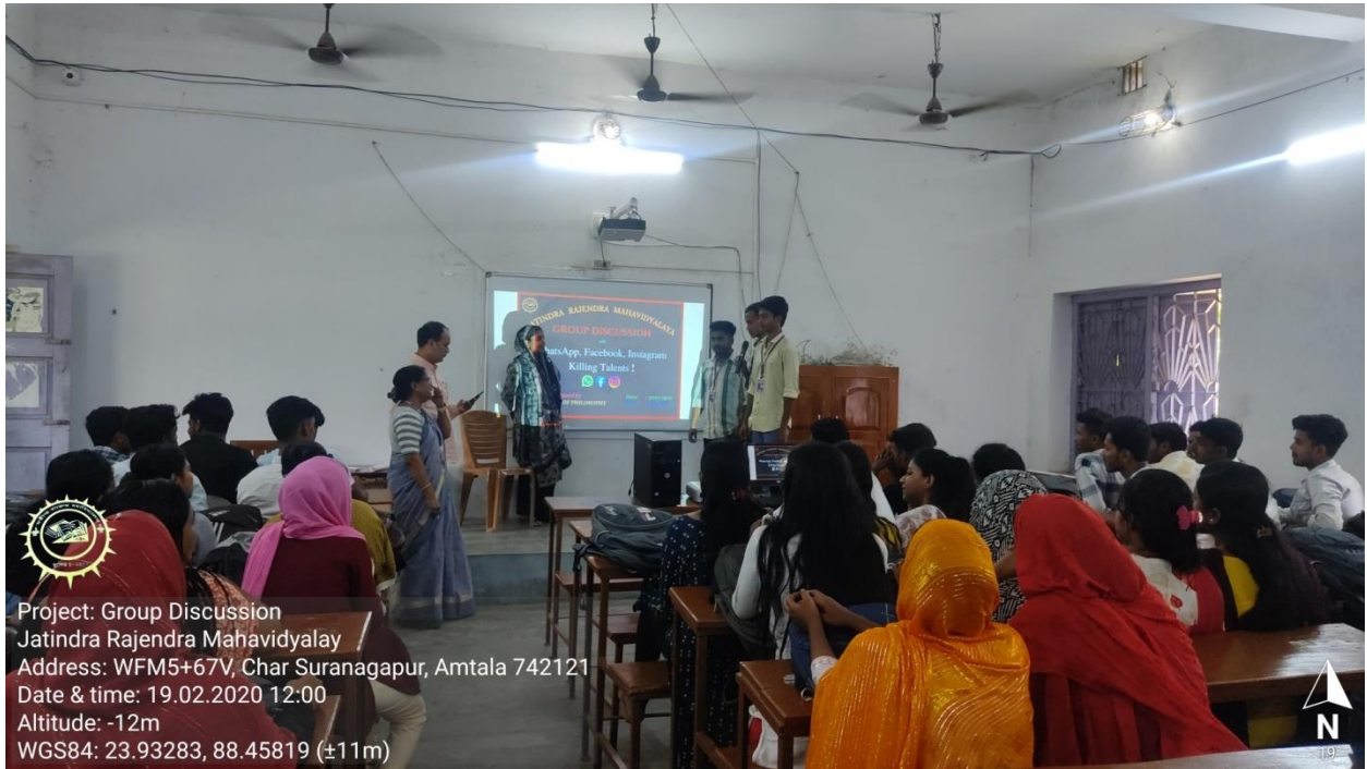
Project: Group Discussion Jatindra Rajendra Mahavidyalay Address: WFM5+67V, Char Suranagapur, Amtala 742121 Date & time: 19.02.2020 12:00 Altitude: -12m WGS84: 23.93283, 88.45819 ( \pm 11 m)