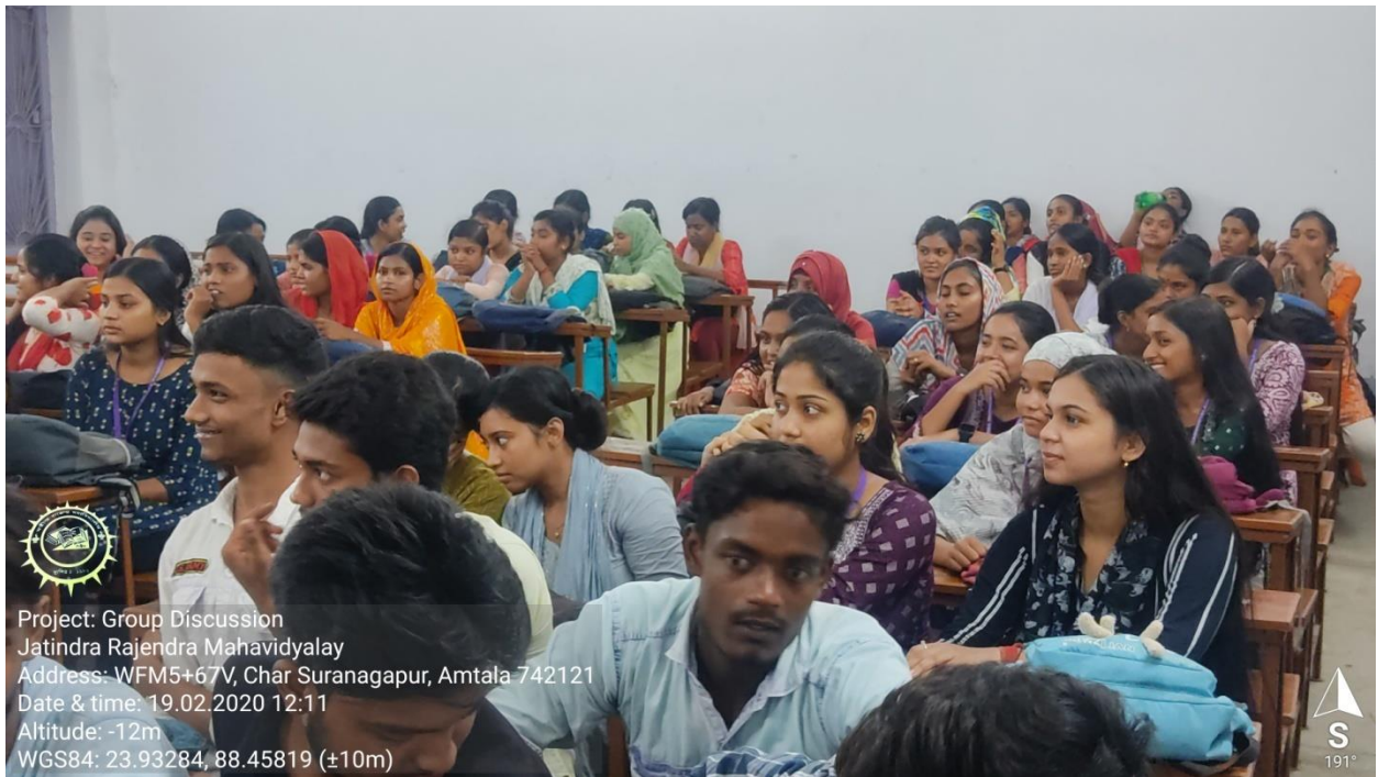
Project: Group Discussion Jatindra Rajendra Mahavidyalay Address: WFM5+67V, Char Suranagapur, Amtala 742121 Date & time: 19.02.2020 12:11 Altitude: -12m WGS84: 23.93284, 88.45819 ( \pm 10 m)